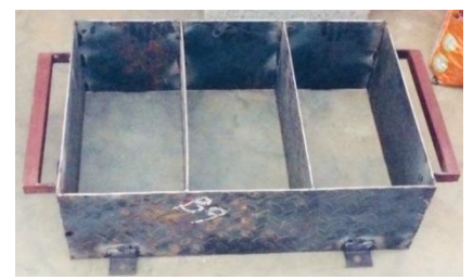
Fig 1: Mould for casting blocks(16*8*8)inches

Waste PET bottles of volume 250ml, 600ml and 750ml were collected from the surrounding area. The PET bottles were filled with soil, collected from a building demolition site. The testssuch as specific gravity, sieve analysis, plastic limit, liquid limit, moisture content etc. were conducted to determine the properties of soil. Cement, M- sand and aggregates (6mm) were also collected and properties determined. To prepare solid blocks, an assembly of three moulds with conventional dimension 16*8*8inches each was fabricated using mild steel sheet. The mould so prepared is shown in Fig. 1.